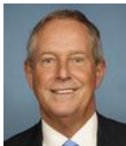
2 nd District

Committees Appropriations Judiciary Armed Services Budget