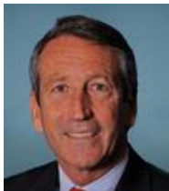
1 st District

Each state elects two senators that serve staggered six-year terms where they both represent the entire state.