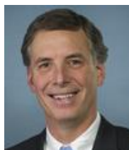
7 th District