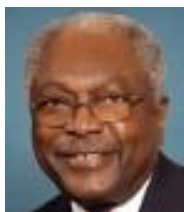
6 th District

Committees Science, Space, and Technology Small Business