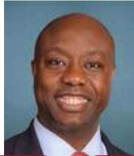
SEN. TIM SCOTT

Serving Since: January 3, 2013 Re-election: 2022