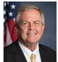
5 th District

Committees Oversight and Government Reform Judiciary Intelligence