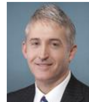
4 th District