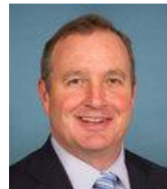
3 rd District

Committees Education and Workforce Armed Services Foreign Affairs