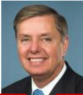
SEN. LINDSEY GRAHAM

Serving Since: January 7, 2003 Re-election: 2020